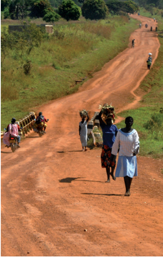
Figure 3. Kitgum, Uganda.