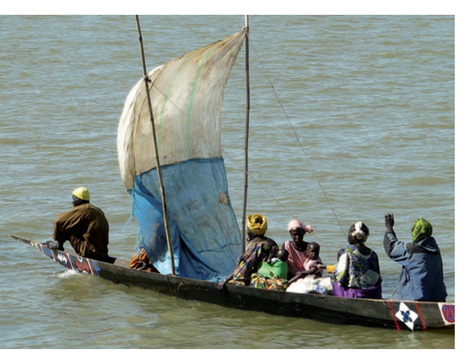
Figure 2. Niger, Mopti, Mali.

In clashing contrast with this scenery, the Niger river flows unperturbed, without realizing that without its water, all around it there would not even be the little that there is. Evening after evening, at sunset, it quietly goes to sleep (Figures 1-2).