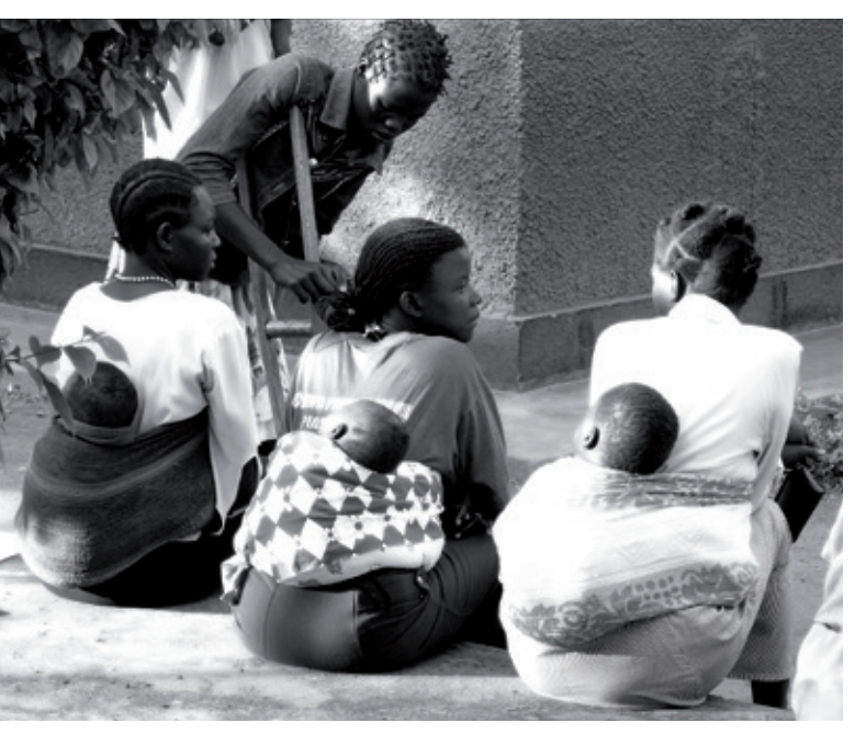
Figure 4. Kitgum, Uganda.

The women work very hard, they cook, go get water however far it may be, harvest and grind wheat to make bread, and watch the children, however numerous. They walk miles and miles, slowly, carrying incredible weights on their heads: extremely heavy containers, clothes still dripping with water from the river, stacks of firewood. You see them often, in groups, on the bank of the river along which, over time, a small cluster of mud and straw dwellings has developed: it's a gathering place, perhaps the only one, where they can socialize, take their children to play when the school is too far away and the kindergarten is right there, along those few yards of riverside where the Niger flows more slowly.